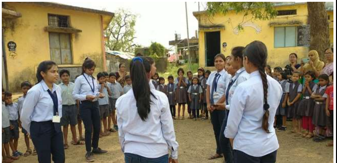
Volunteers engaged themselves in cleaning program and awareness parade spreading messages on various social issues.